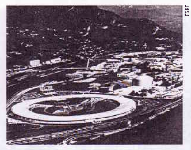
The European Synchrotron Radiation Facility in Grenoble, France. Compound refractive lenses may soon make its intense X-ray beams much more effective.

X-RAY sources have already evolved from the original sealed vacuum tubes into sophisticated electron-storage rings, and free-electron X-ray lasers may be just beyond the horizon. These advances promise intense, highly parallel and tuneable photon beams. To focus and manipulate this radiation, a variety of X-ray optical devices have been developed, ranging from concentrators, in the form of tapered capillaries<sup>1</sup>, to Fresnel zone plates<sup>2</sup>. But a dream of X-ray opticians for some time has been to make a refractive