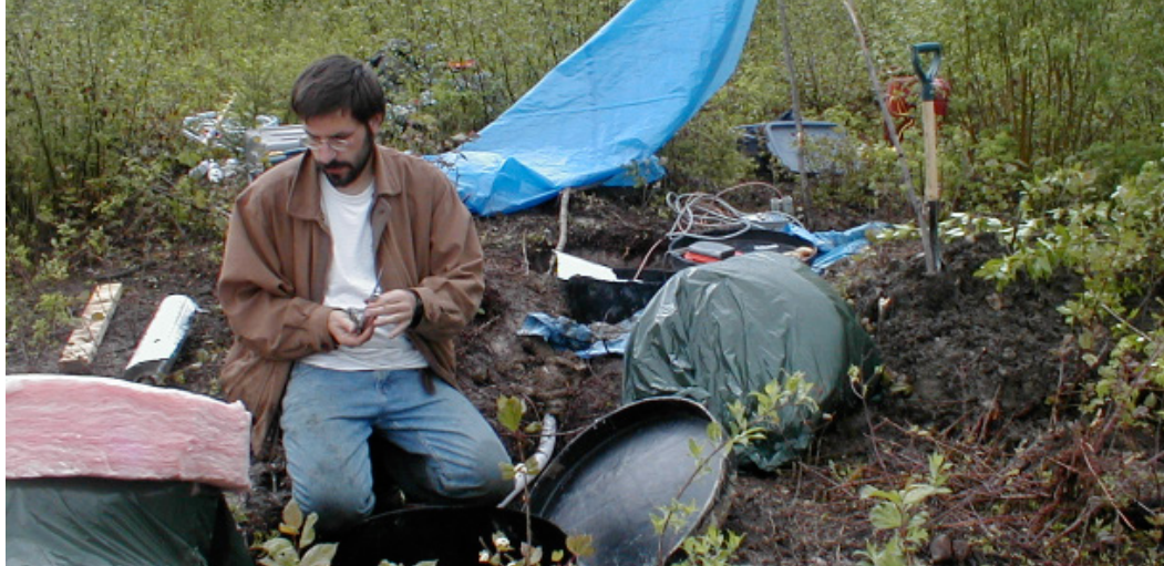
Installation of broadband seismometers in British Columbia.

Our group is also interested in developing and