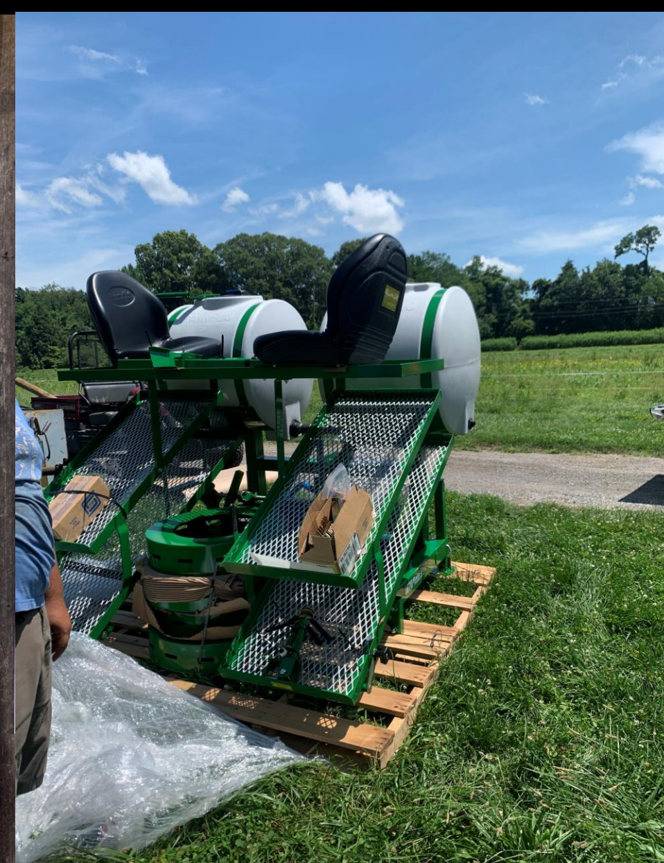
New planting equipment for the tractor