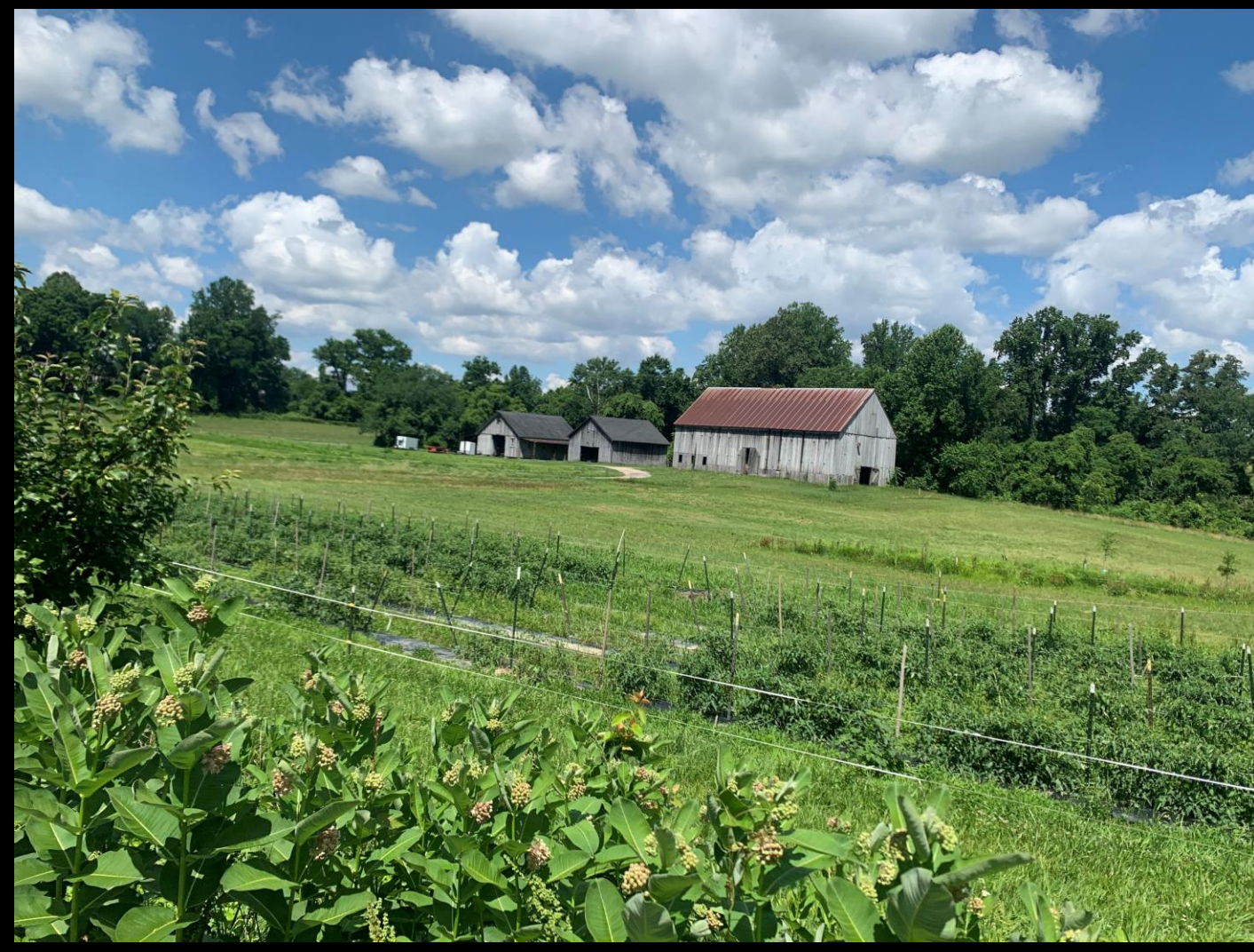
A view spanning the middle of the farm overlooking a few old tobacco barns.

College Park Scholars – Science & Global Change Program Environmental Science and Policy – Environment and Agriculture Deffinbaughfarms@gmail.com College Park Scholars Academic Showcase, May 6, 2022