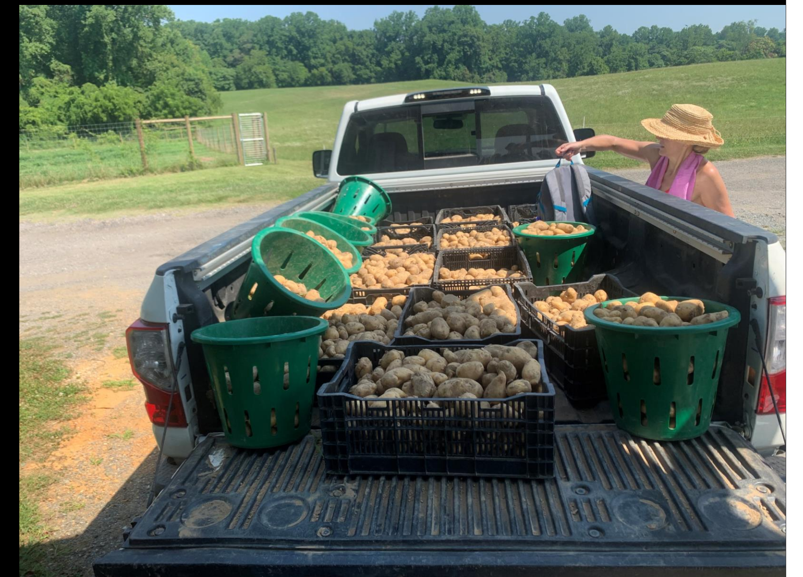
A volunteer looking over 800 pounds of freshly harvested potatoes.