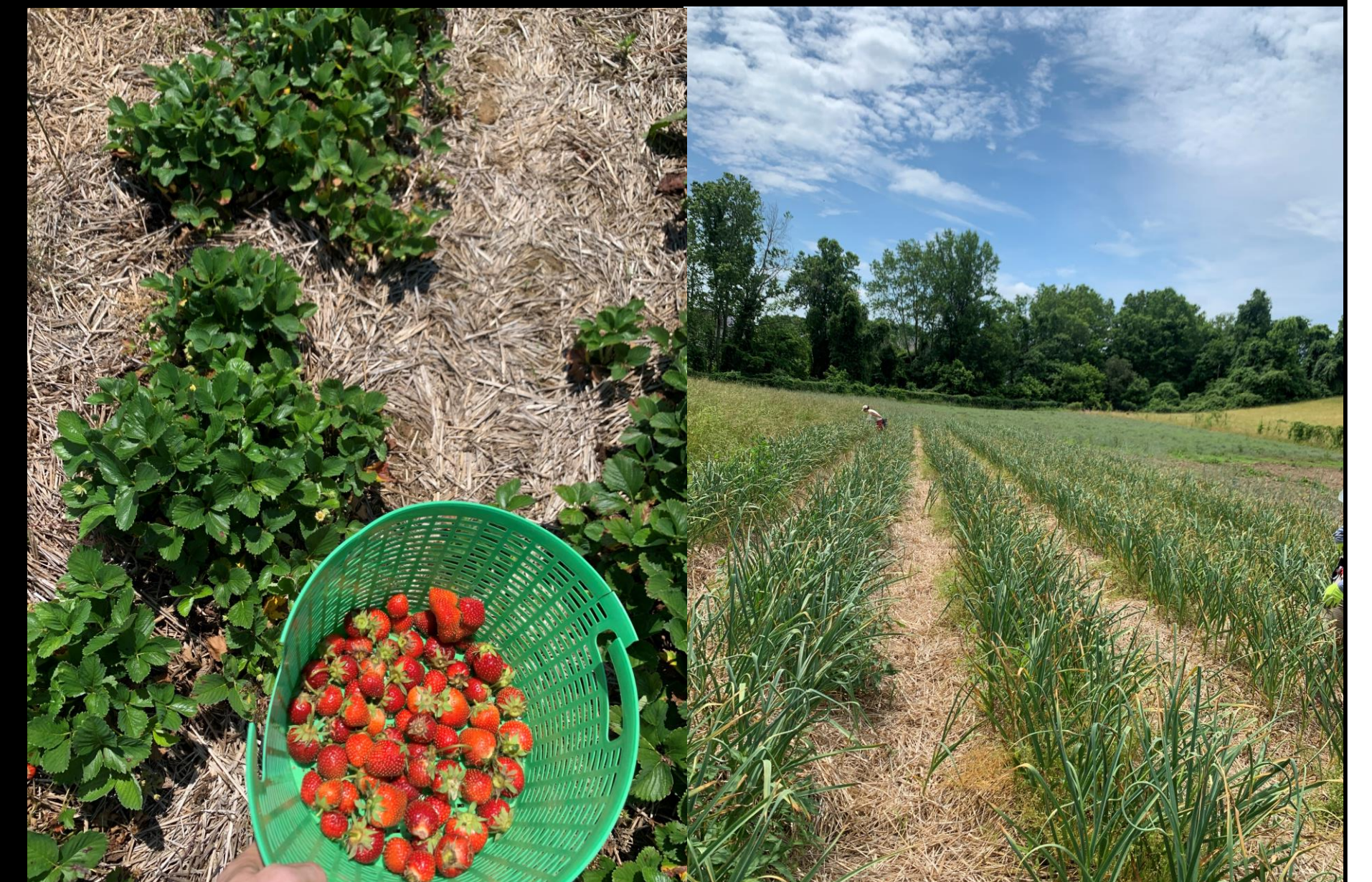
Freshly picked strawberries