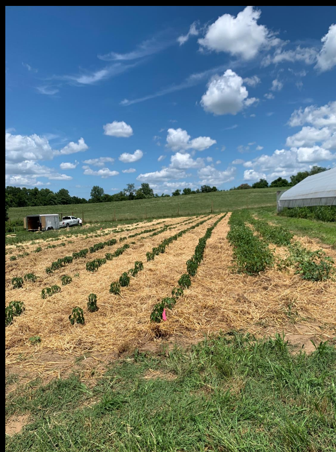
Straw mulched field

Some of the issues at Claggett are just inherent to agriculture in general. These include weather, insects/pests, invariable labor. Since Claggett relies heavily on volunteers some days there would be a lot of help and others where each individual had to do much more. Pests are always a consideration in agriculture. All of this occurs whilst trying to provide food for those in need and benefit the climate system.