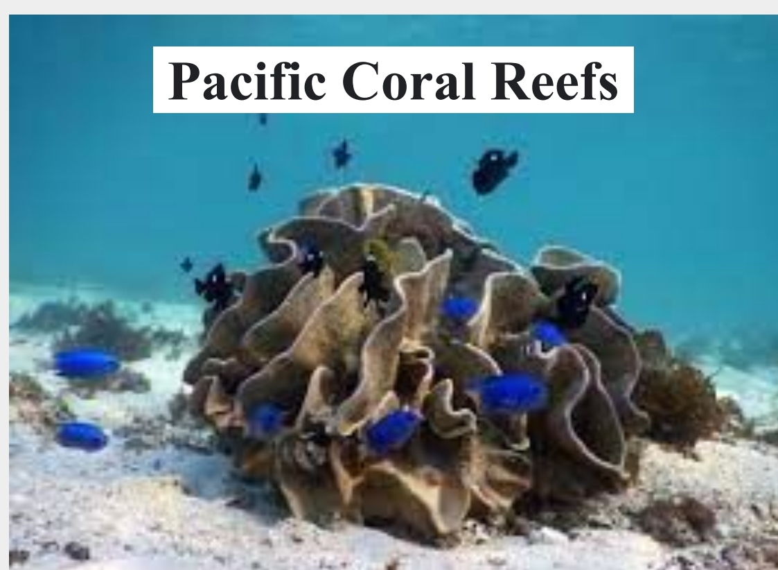
Pacific Coral Reefs

Coastal Protection: With coral reefs impacted, it affects their ability to make skeletons leading to a decrease in protection for coastal regions.