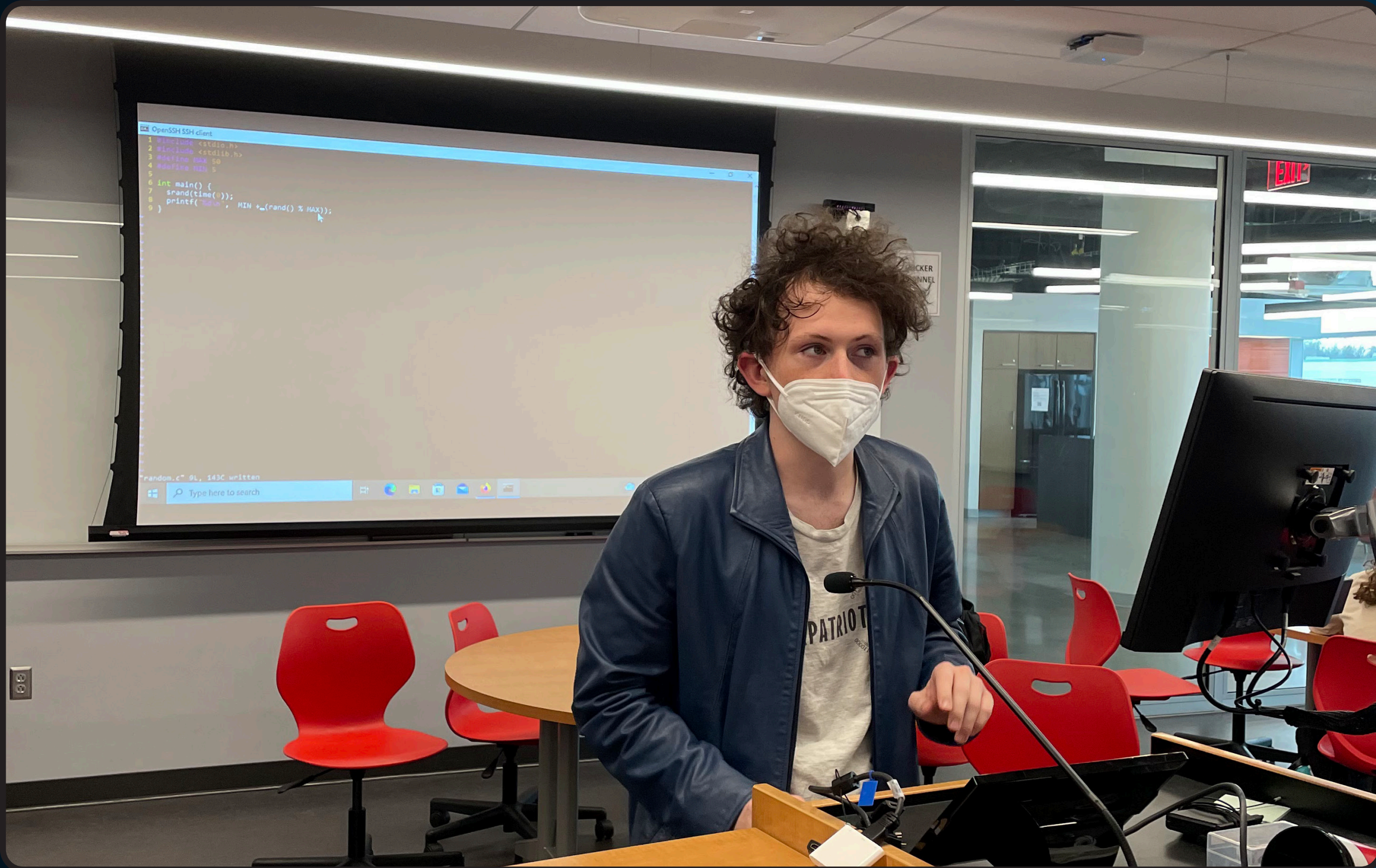
Photograph of me doing announcements and the introductory demo to the class for the biweekly discussion session. Here, I was demonstrating the rand() function.