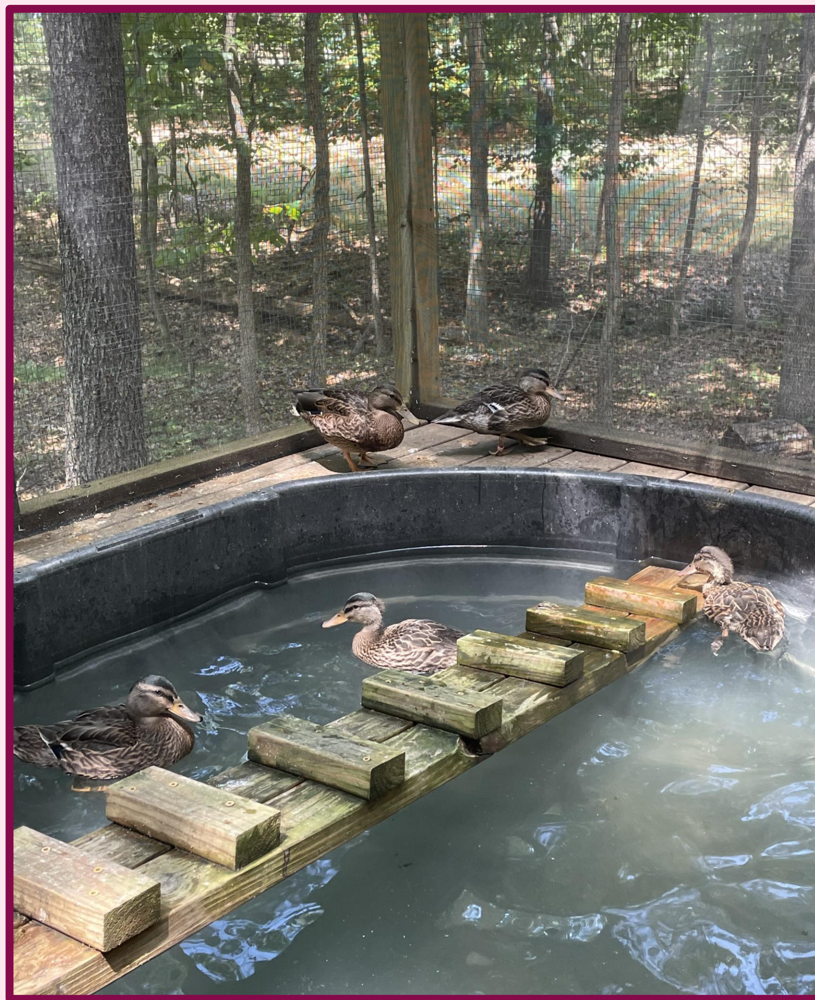
Mallard ducks in the recently built enclosure for them.