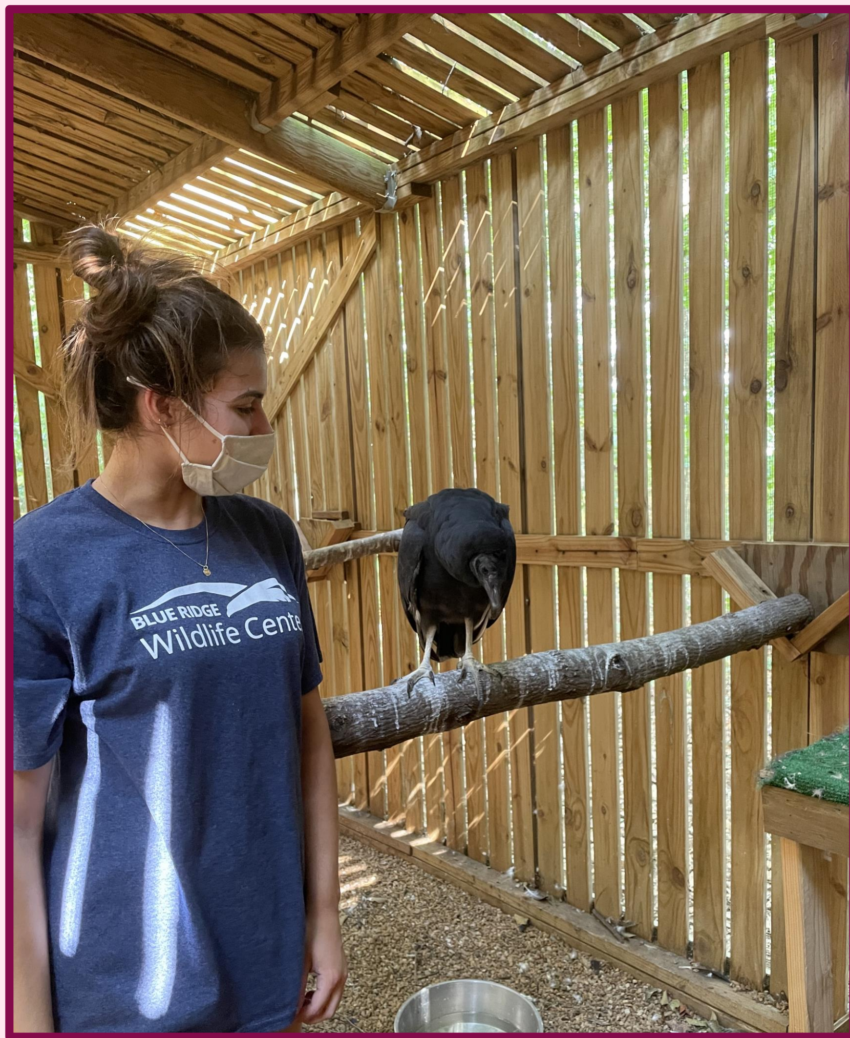
Taking care of a Black Vulture in it's outdoor rehabilitation enclosure.