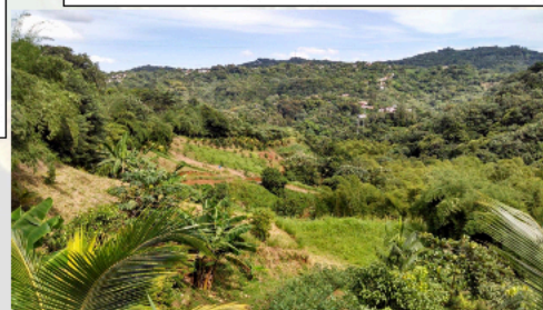
Buena Fruta Farm

Participating in this inspired a sense of purpose. I gained cultural exchanges, knowledge on current solutions to immediate and grave problems, and work-away on-site experience.