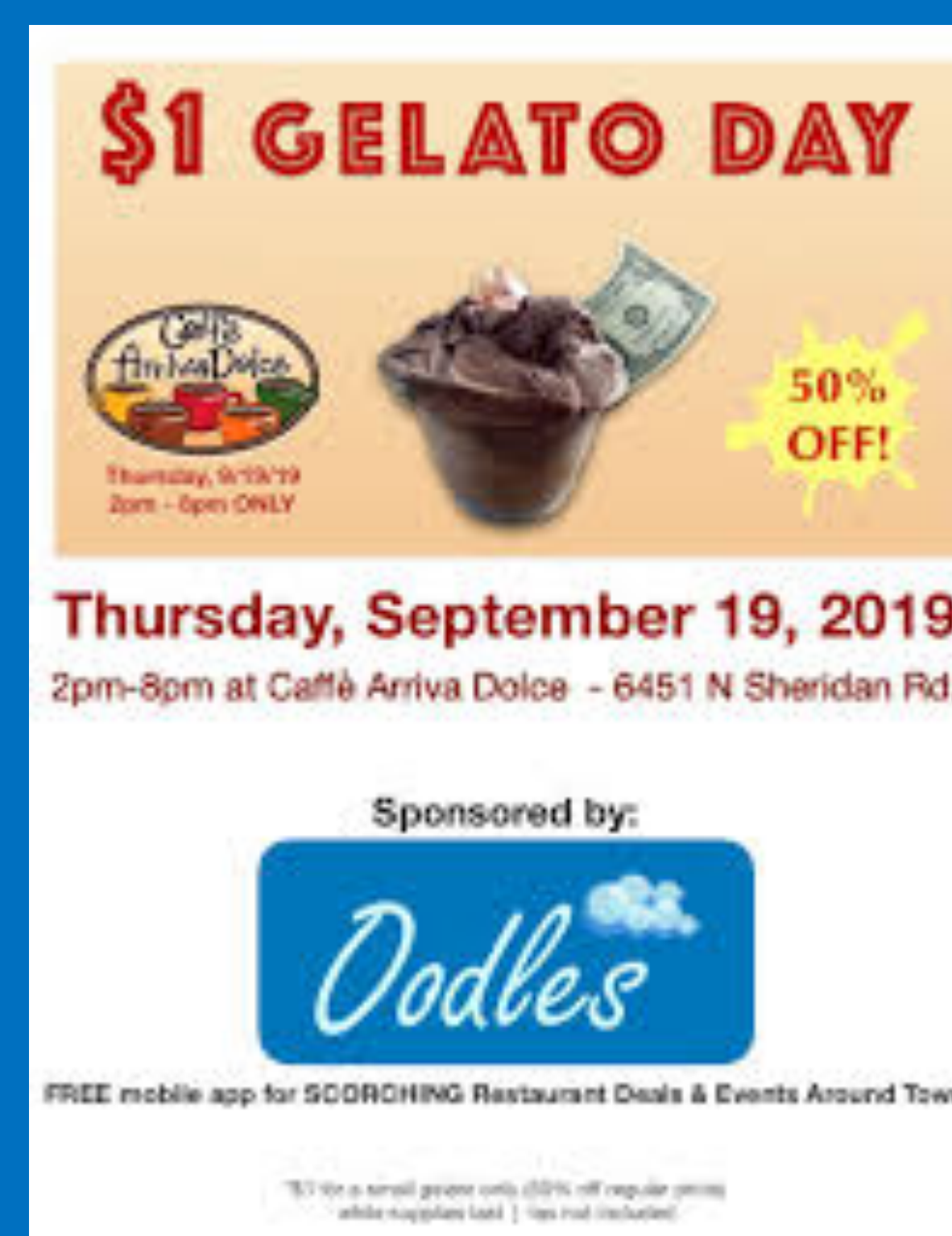
Example Flyer Promoting App