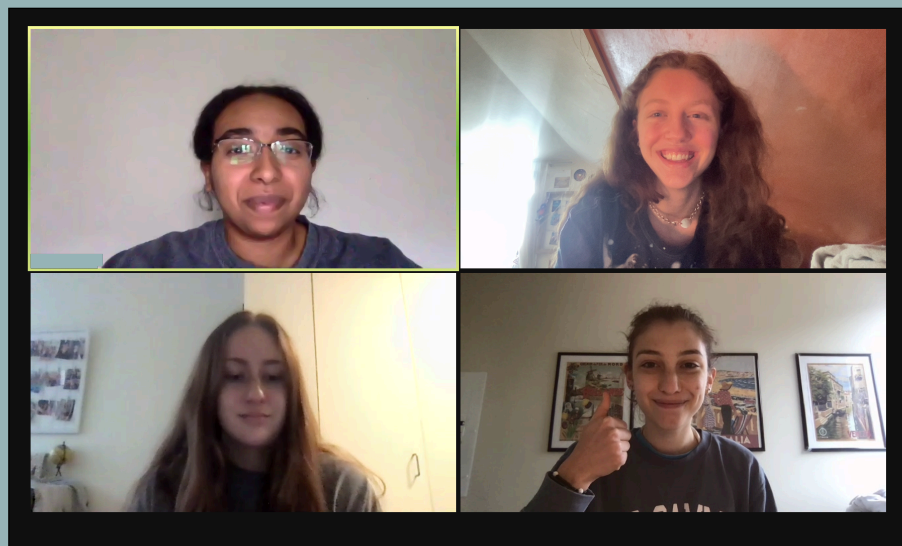
A screenshot of the UMD students I worked with to create the impact assessment.

Activities: Before we began working with the LICC students we had to gain a greater understanding of the history of Liberia and the impacts COVID-19 has had on the country. We had a series of lectures covering many important aspects of Liberia as well as lectures on humanitarian work/aid and agriculture economics. These lectures prepared us for our group project which culminated with an impact assessment. To create the impact assessment we had to create a program directory, an inventory of the current extension programs, and a SWOT (strengths, weaknesses, opportunities, and threats). In addition to creating an impact assessment for LICC we created a “Strategic Recommendations” document stating why we believe LICC needs a dedicated extension department.