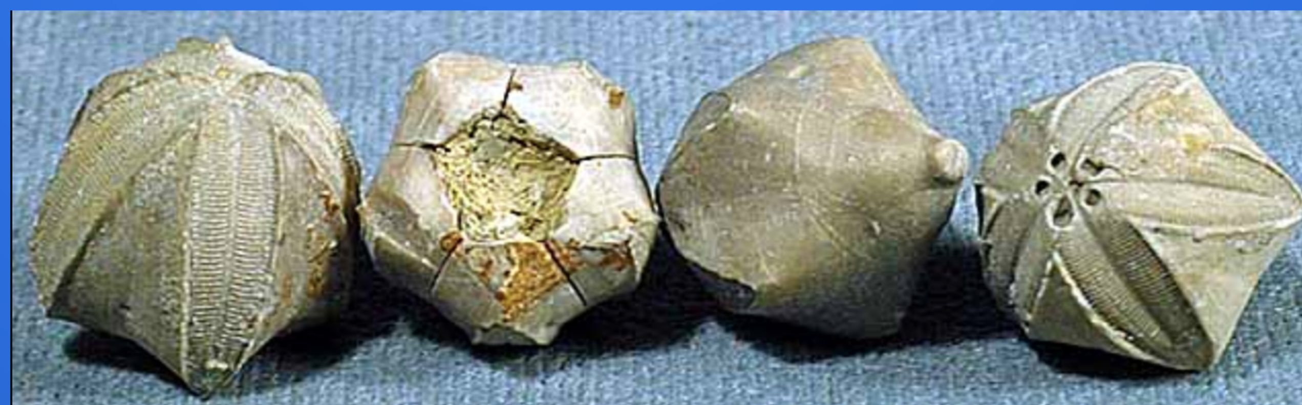
Two species of the Pentremites are shown above. The one on the left is Pentremites obesus and the one on the right is Pentremites symmetricus [6].