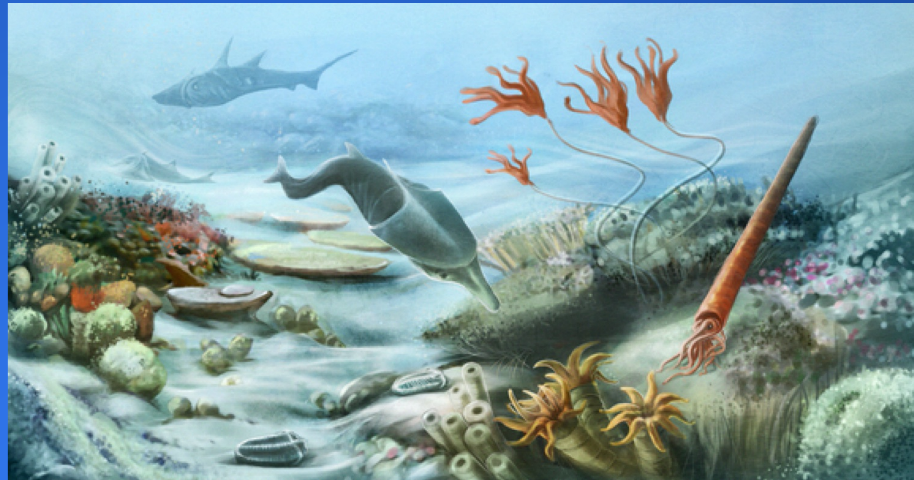
An artistic representation of what life might have looked like for the Blastoid during the Mississippian/Late Devonian era [1].