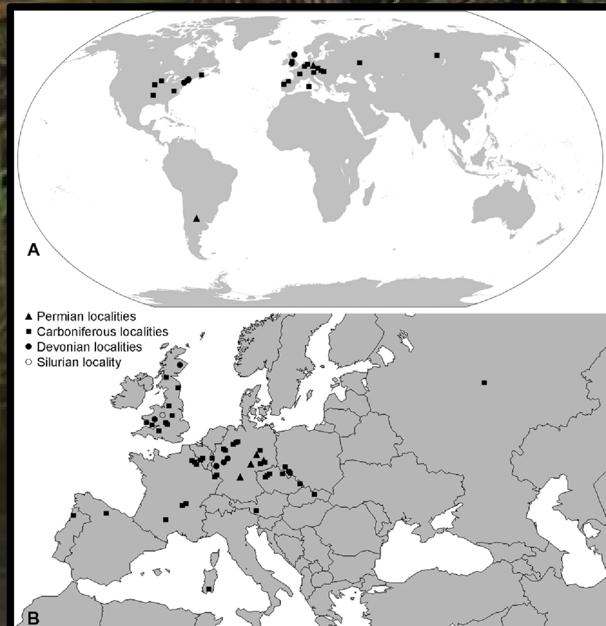
A map of sites where Trigonotarbids have been found [C]