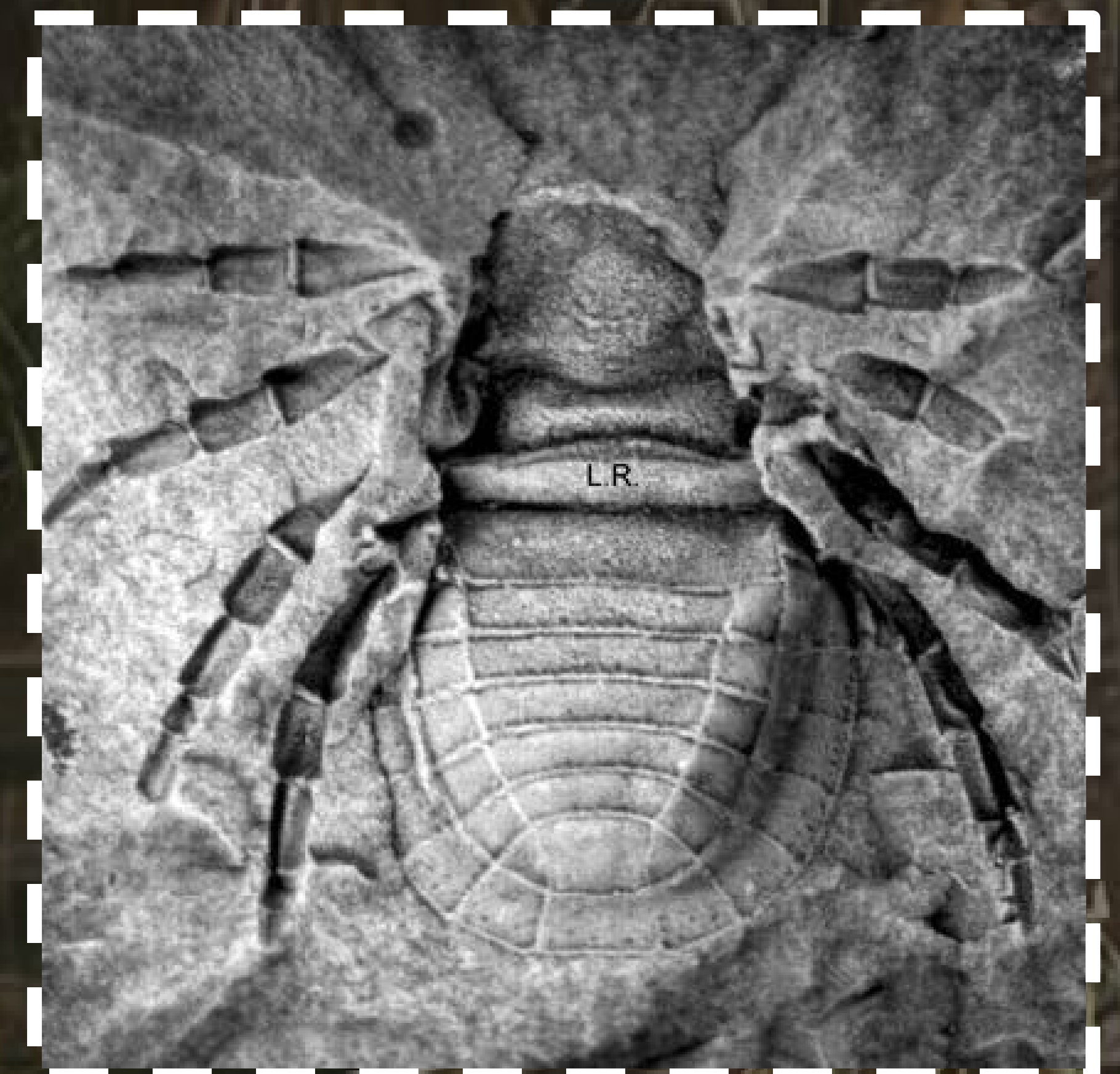
Another trigonotarbid fossil, this one from the upper Carboniferous Coseley Lagerstätte [B]