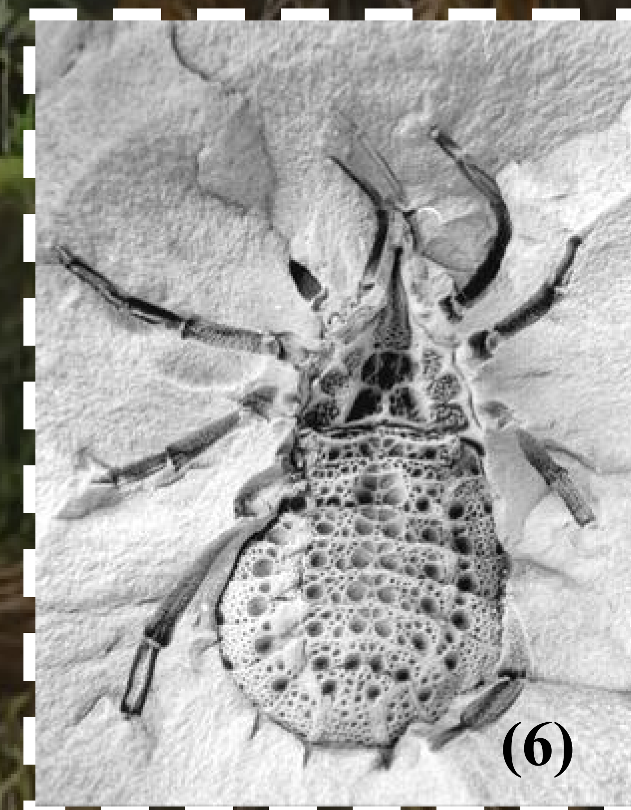
An exceptionally preserved trigonotarbid fossil featuring defensive adaptations, such as spines [B]